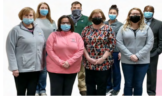
Staff of the Wyandot County Health Department